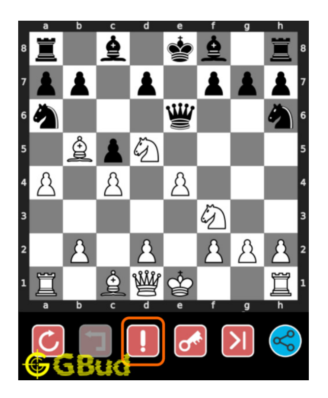
Figure 8: Click the help button to get help on next move @ https://gbud. in/g7d6yf2