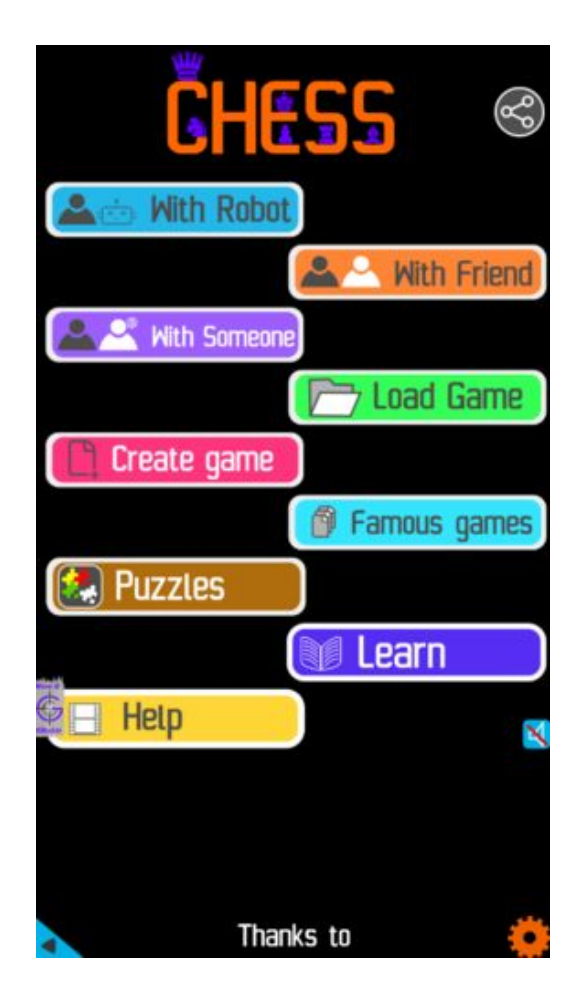
Figure 11: Play chess online for free. Solve puzzles and play with friends

Play chess for free at https://gbud.in/chs