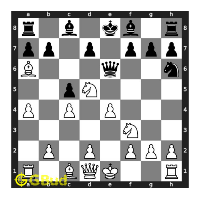
Figure 4: Bxa6 - This capture remove the protection to c7. If the queen does not respond, you can gain the queen in next move by giving a knight fork at c7 in next move