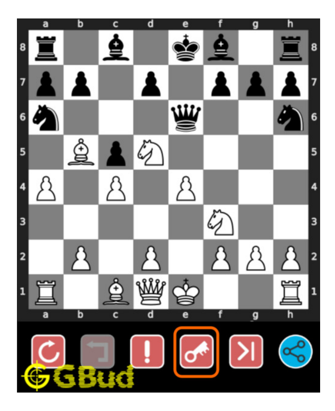
Figure 7: Click the solution button to view solutions @ https://gbud.in/g7d6yf2